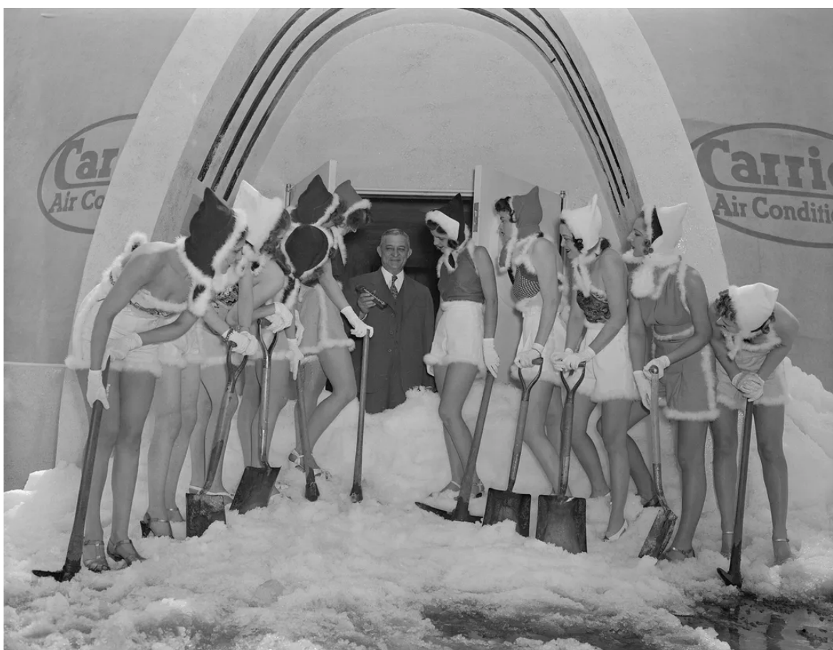
Willis H. Carrier holds a thermometer inside an igloo display that demonstrates air conditioning at the 1939 St. Louis World's Fair.